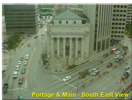
Portage & Main - South East View