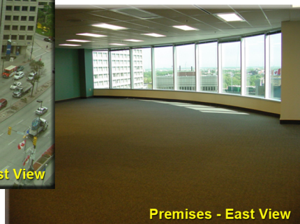
Premises - East View