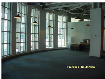
Premises - South View